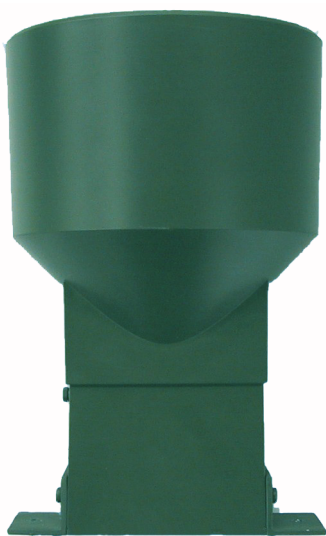
Rain Gauge QMR101M for MAWS201M

The rain gauge is installed on a sensor support arm and it is delivered with a ready-made 1-meter (3-foot 4-inch) connector cable.