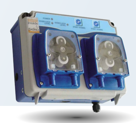
OplBasic L Dosing system with a peristaltic pump