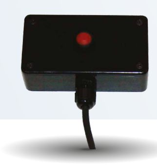
Remote Control Accessory with 8 ft. cable