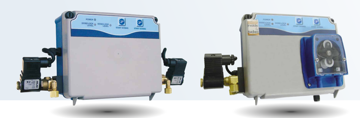
OplBasic DD Dosing system with double solenoid valves