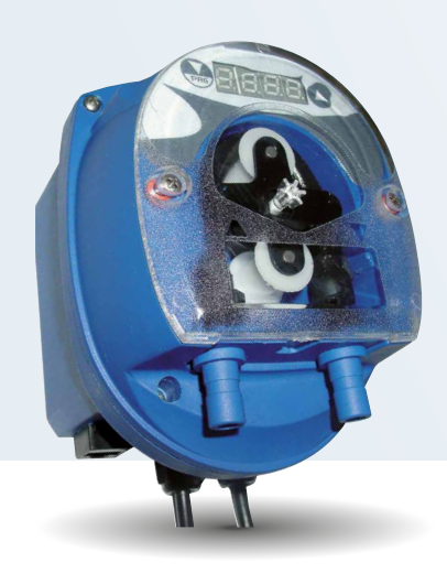
OplMini L Multi-function digital peristaltic pump